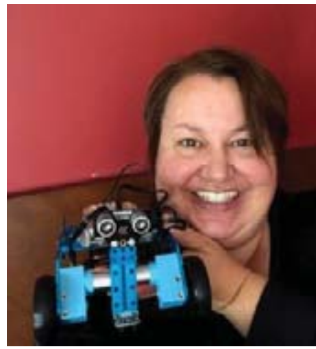
Amber Thompson Photos provided

Online enrollment is free to local Girl Scouts of America Service Unit 327 (comprising 60-plus troops and over 550 Girl Scouts) on a first come, first serve basis.